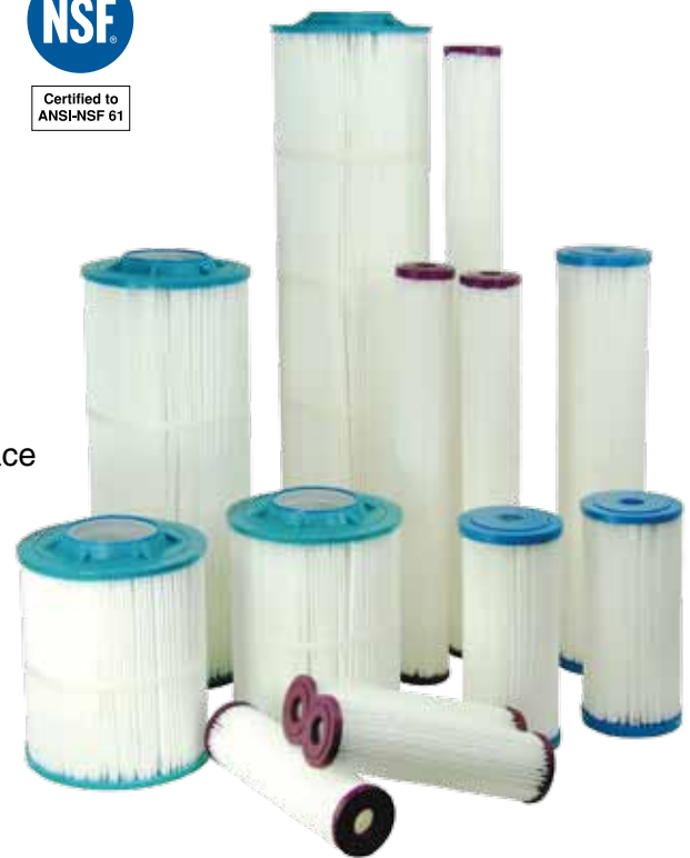
Harmsco® Poly-Pleat™ Series Filter Cartridges